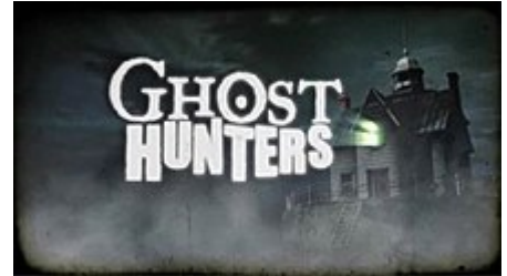
Title card used in seasons 5 and 6 of Ghost Hunters , depicting Race Rock Light , which was investigated during season 1.